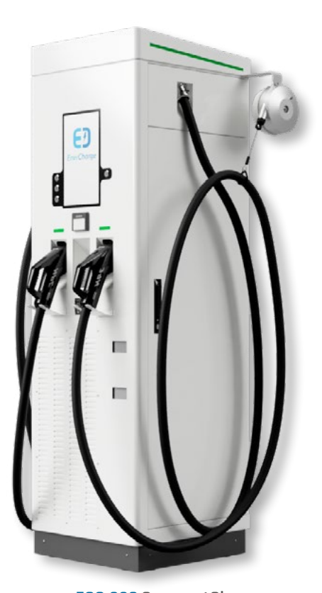
ECC 320 CompactCharger